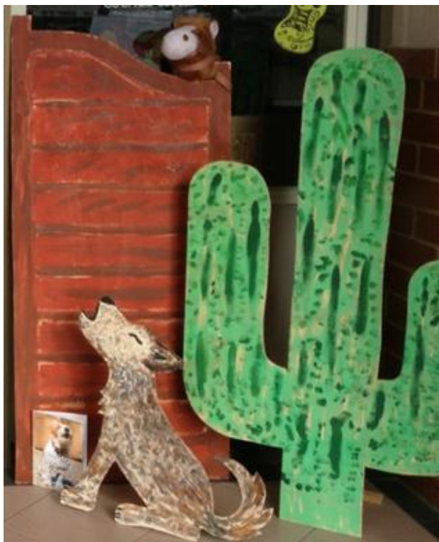
Barmera Library winning window display for Country Music Week

Barmera Beautification Committee meetings held at Barmera Library bi-monthly are another way the community and library collaborate to achieve maximum benefits for the community.