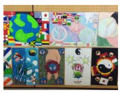
Some of the posters are shown here.