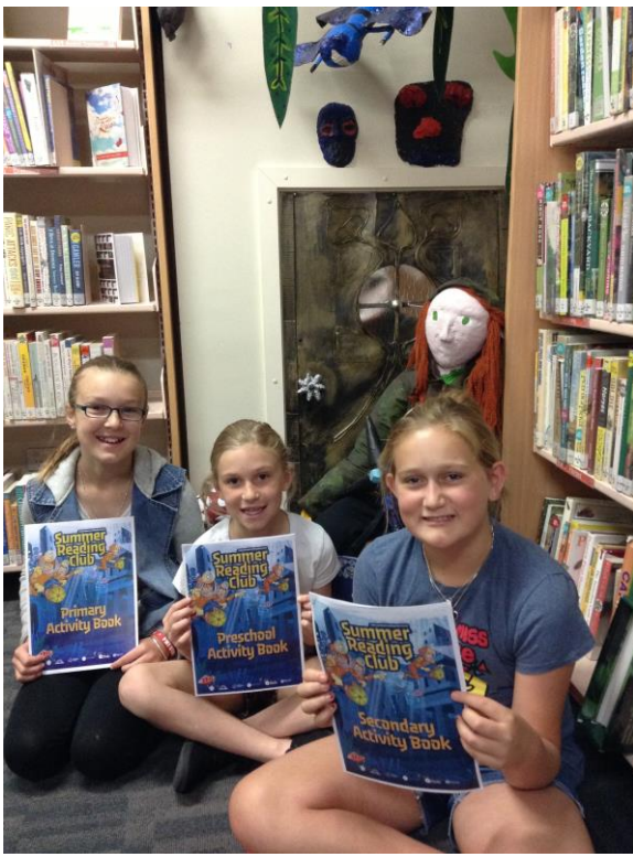
Happy participants in Barmera Library's Summer reading Club with the Lost Worlds Art Display from Glossop High School.