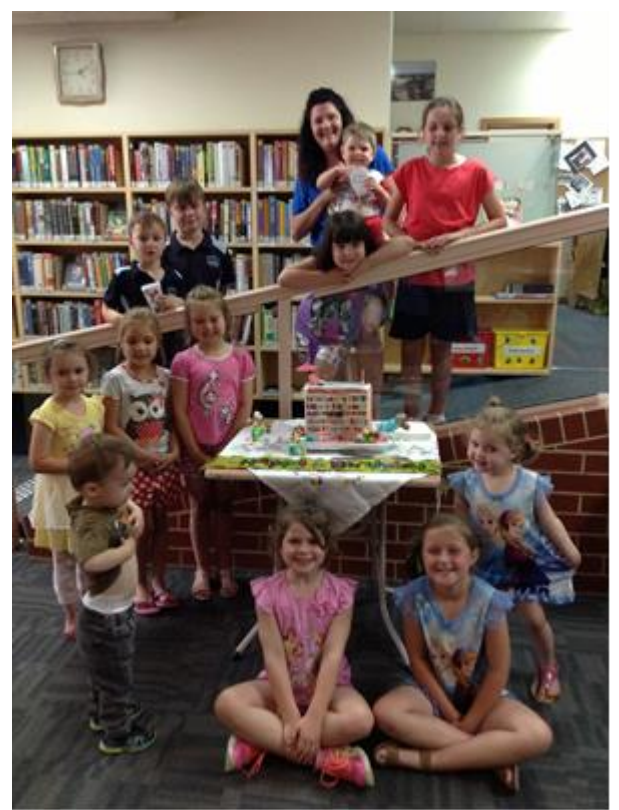
Party goers help celebrate the Barmera Library's 54th Birthday in October 2015.